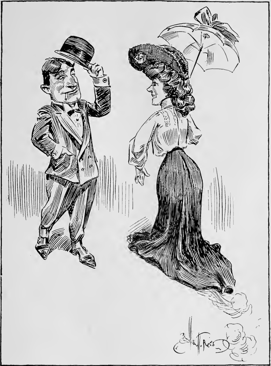
THE HANDSOME KNIGHT SHE MET IN ELMDALE PARK